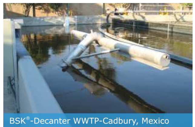
BSK®-Decanter WWTP-Cadbury, Mexico

We specialise in individual solutions "tailor-made" to the demands of specific project requirements. Some of these WWTP projects are described in detail by our "case histories" as well as photos, which are part of this bulletin. For more information several leaflets, CD presentations and final effluent test result reports which are available on request.