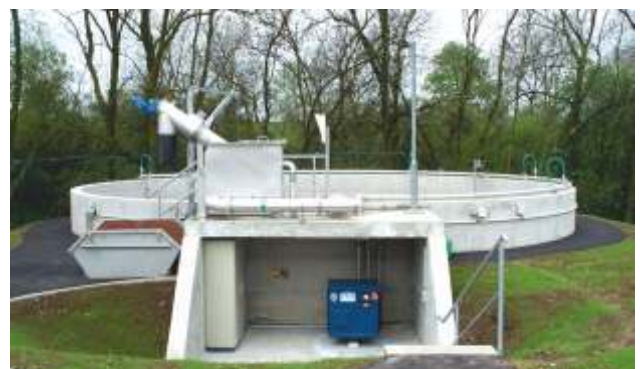
SBR-WWTP Village Bösleben, Germany