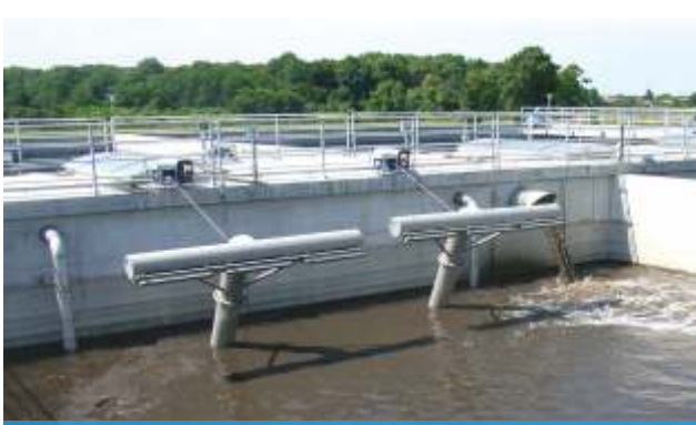
BSK®-Decanter WWTP Koprivnica, Croatia