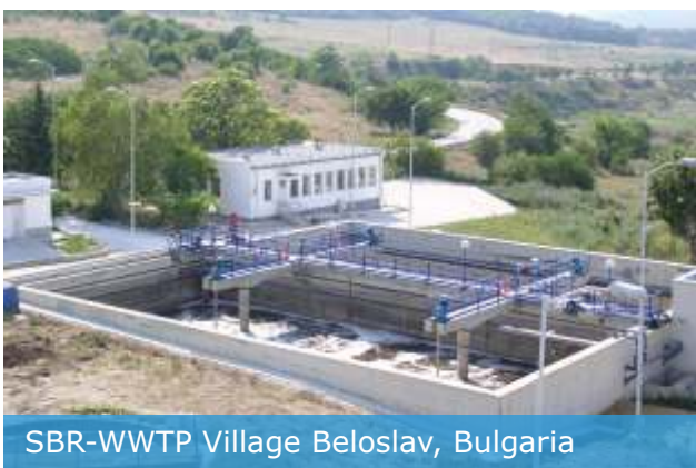
SBR-WWTP Village Beloslav, Bulgaria