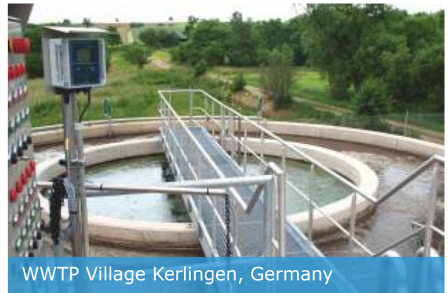
WWTP Village Kerlingen, Germany