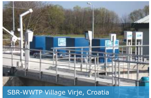
SBR-WWTP Village Virje, Croatia

Our knowledge of wastewater treatment and aeration systems is based on many projects, successfully designed and completed by us over a number of decades, both in Germany and worldwide.