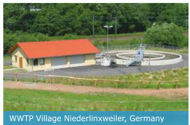
WWTP Village Niederlinxweiler, Germany