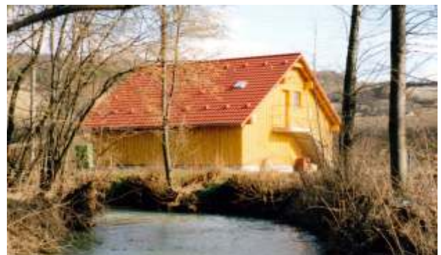
SBR-WWTP Village Göttern, Germany