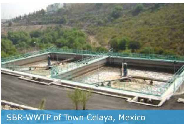
SBR-WWTP of Town Celaya, Mexico