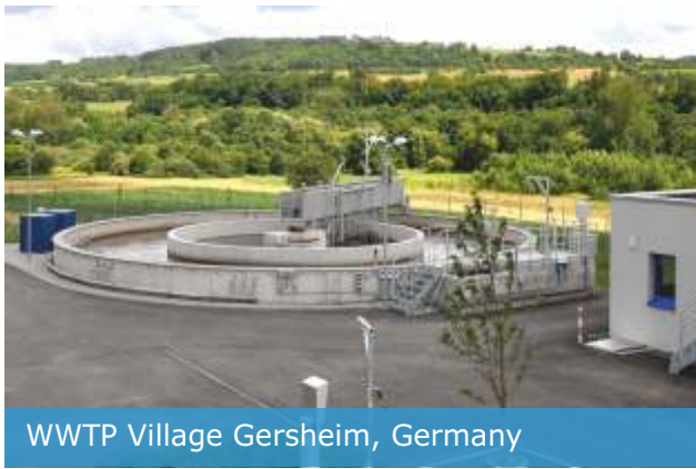
WWTP Village Gersheim, Germany