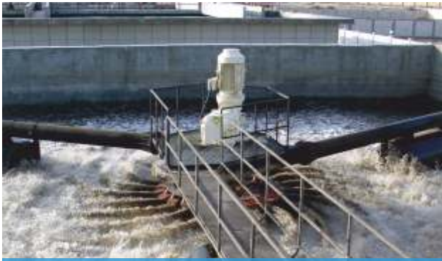
SBR-WWTP of Town Amreya, Egypt