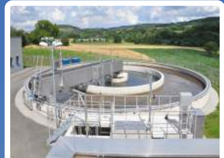
Wastewater Treatment Plants