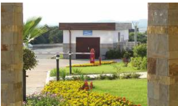
Hotel-WWTP (SBR) "Humata", Bulgaria

Our activities have expanded beyond the German market. We work with customers and consultants worldwide to produce wastewater treatment plants, which are individually designed and equipped to project specific requirements using high-quality German equipment – promising a straight forward, high level operation over a long life-time.