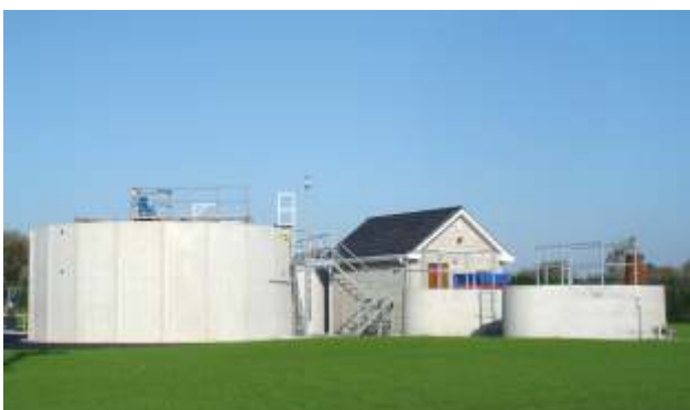
SBR-WWTP Village Carrick, Ireland

For more than 30 years we have offered SBR plants on a turn-key basis or as a package of “engineering and equipment”. Our SBR components like aeration systems (BSK ® turbine) and effluent discharge systems (BSK ® decanters) is not only a typical component of our own