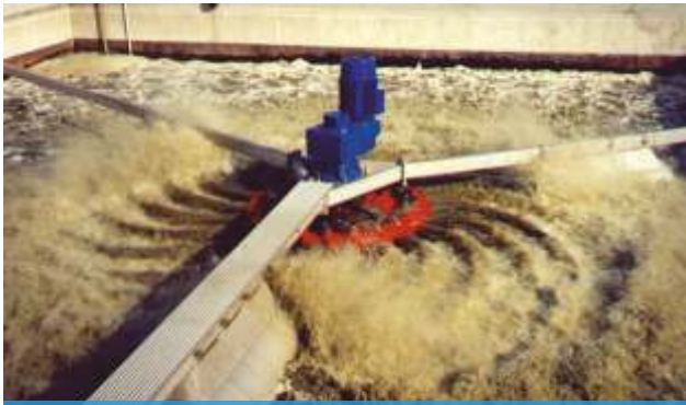
SBR-WWTP Village Krzyz, Poland