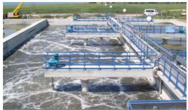
WWTP Tourist Zone “Sunny Beach”, Bulgaria