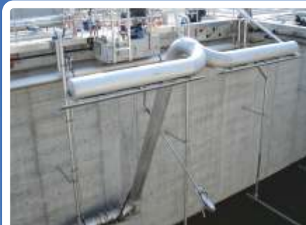
BSK® Effluent Decanters