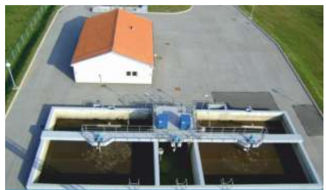
SBR-WWTP Village Molve, Croatia

Several “case histories” are available – in addition to detailed bulletins describing the BSK ® products for SB reactors.