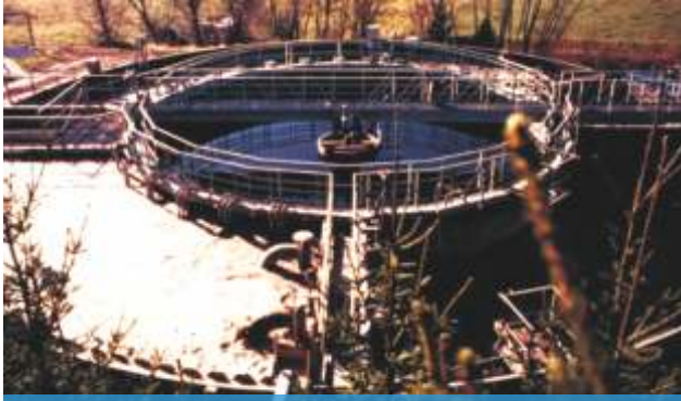
Brewery Rothaus AG, Germany