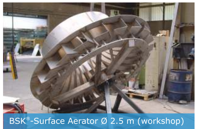
BSK®-Surface Aerator Ø 2.5 m (workshop)

BSK®-turbines are available with diameters beginning at 900 mm and ending with 3,150 mm. They can be installed at floating systems (SB-reactors or sludge storage tanks) or at fixed bridges (overflow-reactors).