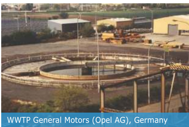
WWTP General Motors (Opel AG), Germany

The German term “Kombibecken” (combined tanks) describes the characteristic shape of our “continuous flow concept”: the combination of two concentric tanks. The inner tank forms the final clarifier, while the ring-like outer basin represents the aeration tank.