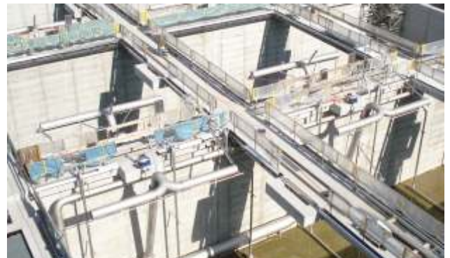
BSK®-Decanter WWTP Uster, Switzerland

(compared with other discharge systems) and guarantees, that the SBR process runs perfectly. Using a specially designed inlet pipe, connected to a maintenance-free twisting link, the final effluent is discharged free of turbulence and without disturbing the sludge blanket.