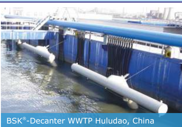
BSK®-Decanter WWTP Huludao, China

Biogest International® GmbH has developed a so called “decanting system”, which offers many advantages