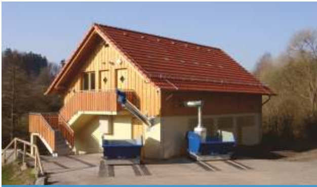
SBR-WWTP Village Bubach, Germany