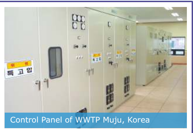
Control Panel of WWTP Muju, Korea

Our control panels are equipped exclusively with components of manufacturers, which are represented worldwide (i.e. Siemens, Phönix, Endress & Hauser, etc.). Due to this international standard, local