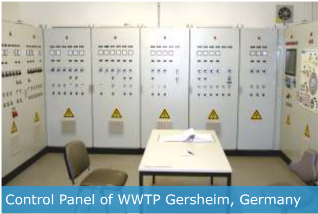
Control Panel of WWTP Gersheim, Germany

maintenance and repair could be easily achieved – including in less developed countries.