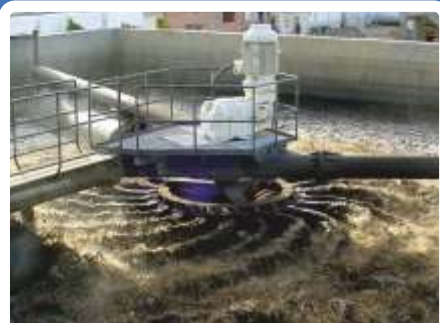
BSK® Surface Aerators