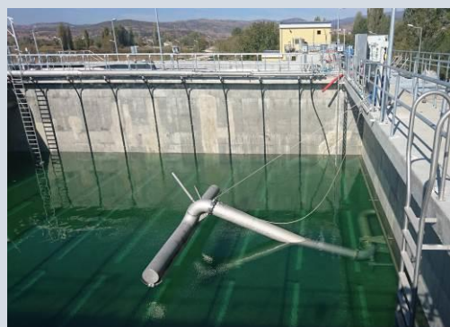
WWTP Radovish, Macedonia