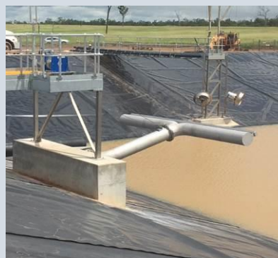
WWTP Livingstone, Australia