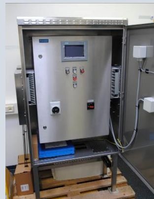
The control of a BSK-decanter can be performed by a local switchbox (on the left) or by an own control cabinet with PLC (middle and on the right)