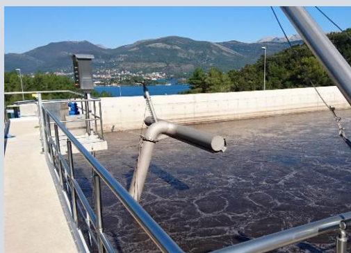
WWTP Tivat, Montenegro