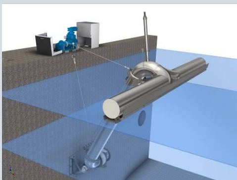
Animation of a BSK®-decanter DN 400 with operating water levels