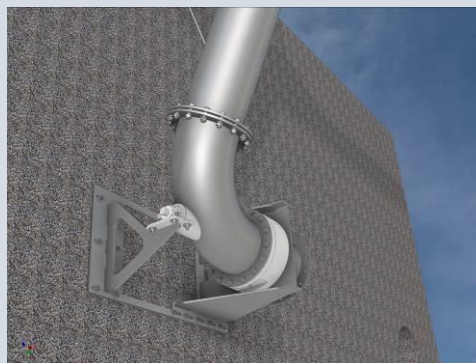
Animation of a BSK®-wall support with swivel joint