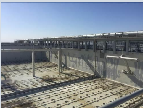
WWTP Port Said, Egypt